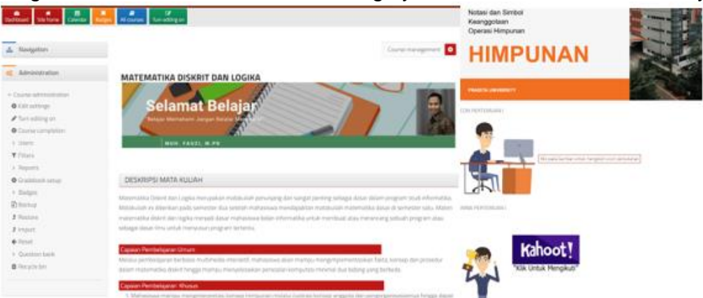
FIGURE 4. Resources and digital platform